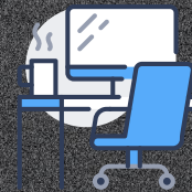
Work From Office