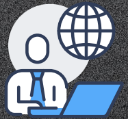
Work From Anywhere