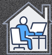
Work From Home